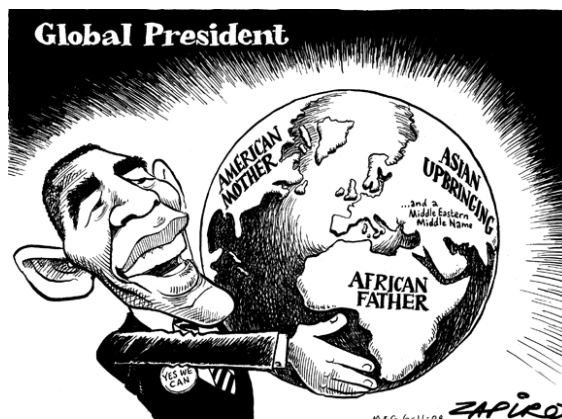
Featured in The Mail and Guardian on 7 November 2008

The G20 meeting in Washington on 15 th November, and the Doha meeting on Financing for Development at the end of this month, are generating more attention than concrete ideas. Both take place during a 'lame duck' period in the US. The APP is doing what it can to ensure that African interests and needs are represented at both events in any redesign or evolution of global architecture and to reinforce the importance of strengthening mutual accountability between Africa and its partners. Above all, poor people and countries should not be penalized as rich countries manage the fallout from the financial crisis.