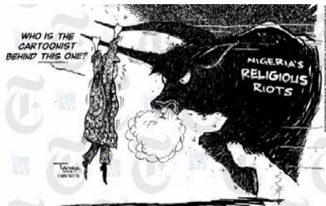
Featured in This Week , Nigeria, 1 December 2008

The side event co-sponsored by the AfDB, AU, ECA and APP was among the best attended at Doha, with an impressive number of Ministers from Africa and its donor partners. Ably chaired by Trevor Manuel, the emphasis was on the need for stronger African political leadership both on the global stage and at home to ensure that the impact of the global crisis is contained.