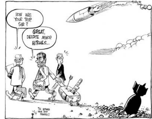
Cartoon by Gado Mwampembwa

The paper co-published by the Africa Progress Panel and Grantham Research Institute on Climate Change and the Environment argues that Africa should receive urgent funding for adaptation to climate change impacts. An additional $30 billion per year in external funding will be needed to 'climate-proof' measures to achieve the Millennium Development Goals.