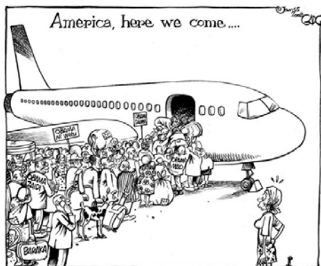
Featured in The Daily Nation (Kenya), 14 January

The inauguration of a half African US President is a source of joy. Expectations in some quarters are sky high, but it may take some time before domestic priorities allow Barack Obama to focus on Africa. In the meantime, Africa can take pride in his success.